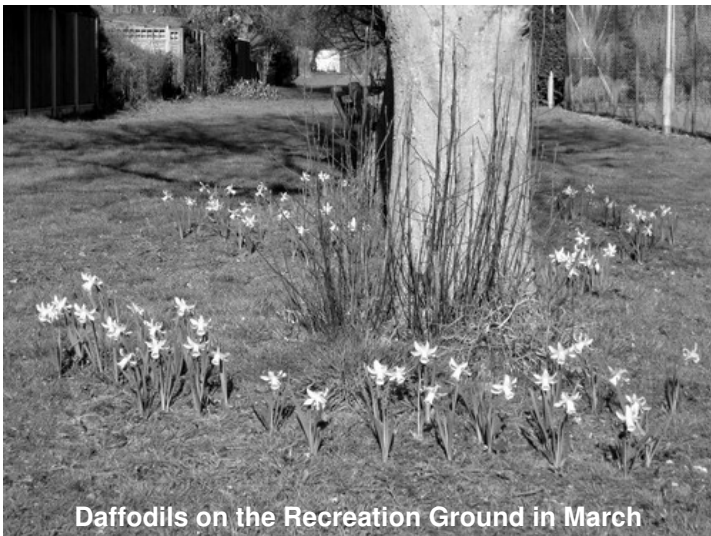
Daffodils on the Recreation Ground in March

All thanks to the working group and their planting efforts last year. Look out for the shrubs and trees they also planted.