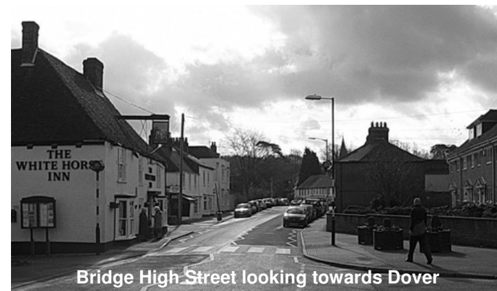
Bridge High Street looking towards Dover