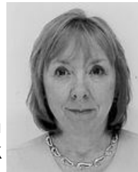
Your Parish Clerk