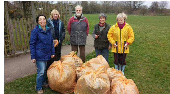
Working Party 2015

Please come along to the pavilion from 9 30 am, wearing warm clothes and bring your gardening gloves and tools to help with the Spring tidy up.